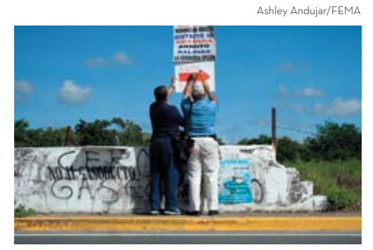
High-tech tactics are extremely useful when bringing people together post-disaster. But it's still important to get out into the community, posting flyers and even going door-to-door.

Survivors find many different ways of keeping abreast of what's going on in the wake of a disaster, so be alert to how news travels in your community. The internet has played an important role in more recent recovery efforts (see "Embrace Technology," page 9), but many low-tech tactics are effective and often necessary given the circumstances.