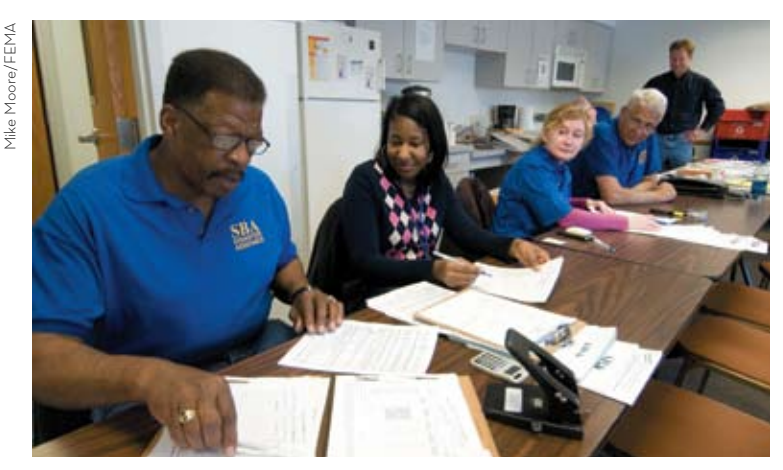
Community recovery groups are best served when they maintain productive and cooperative relationships with government agencies charged with helping them.