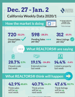
Weekly Market Minute Reports