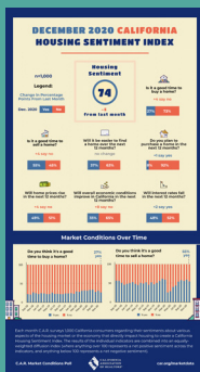
Market Data Infographics

Add something cool to your website, social media or next client meeting with beautifully designed and easy-to-download infographics for your clients and your specific market area: