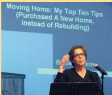
A fire survivor shares her experience moving into her new home at a workshop sponsored by United Policyholders in Rancho Bernardo, Calif.

Government liaison and permit streamlining work groups generally take on the following tasks: