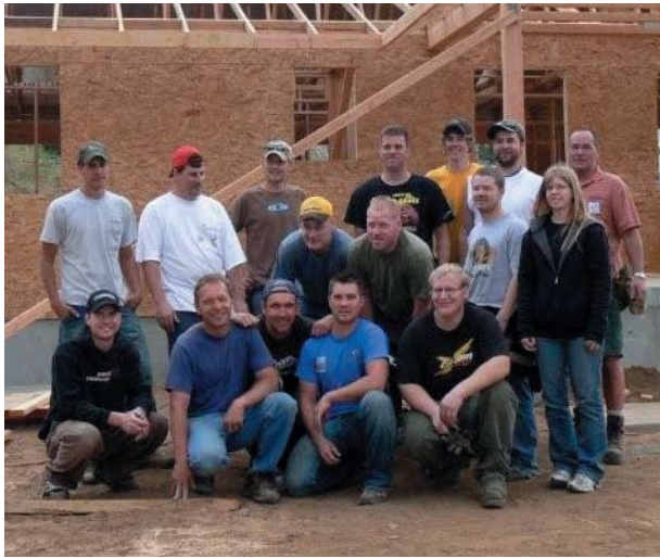
Volunteers from Mennonite Disaster Service help rebuild homes in San Diego County.

WORK IN EACH of the critical areas laid out above can begin immediately and grow more sophisticated with time. Don't wait until all of the disaster survivors are accounted for to begin organizing work groups and holding regular meetings. Gather at least once a week in a place where survivors will feel comfortable. Remember, it is very important to meet in the same place consistently if you can. Practice the approaches to communication and outreach suggested in this booklet and invent some new ones of your own. Expect people to come in when they feel ready. Once they've decided to attend, give them time to settle in. Don't work too hard in demanding that people participate. Simply do what good organizers always do: